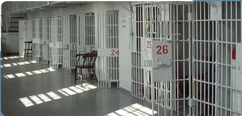
Disproportionate minority contact/confinement (DMC) impacts communities in Illinois and throughout the United States.

A QUARTERLY PUBLICATION OF SAFER FOUNDATION | SUMMER 2010