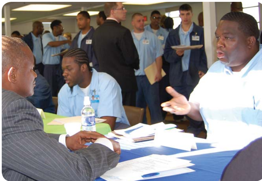
The majority of people seeking Safer Foundation's services are minorities. Blacks have consistently been the majority while Latinos represent the fastest growing demographic.

This study was controlled for factors such as age, generic physical appearance and self presentation, educational attainment, and nature of work experience. The conclusion was that race appeared to have a higher negative impact on job prospects compared to a criminal record, and that opportunities for employment are particularly bleak for black males with