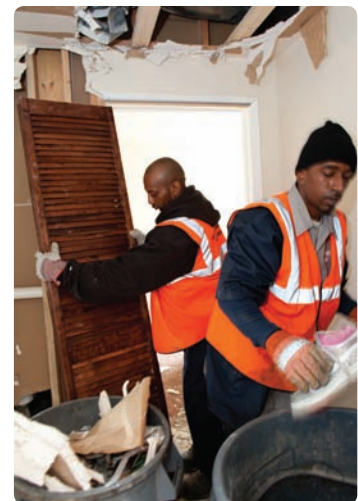
A&D Property Services

“Safer helps secure the future of the person with a criminal record by meeting the needs of the employer, who can help provide that future. It's one of those win-wins that works.”