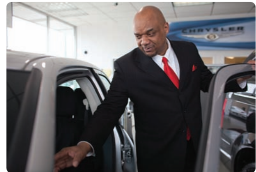
South Chicago Dodge