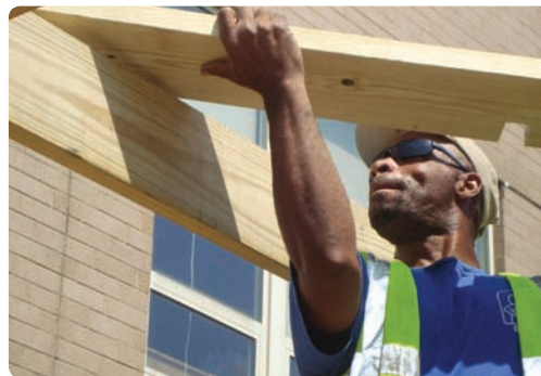
City of Chicago Department of Environment, Greencorps Chicago